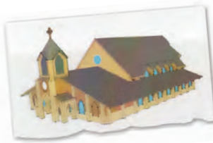
A rendering of the proposed new church

R ESIDENTS OF LAMAR, MISSOURI, were horrified on February 8, 2009, when St. Mary's Catholic Church, a fixture of the community since 1904, was set ablaze by an arsonist. St. Mary's was the only Catholic church in all of Barton County and the spiritual home and social hub for Catholics in the region for several generations.